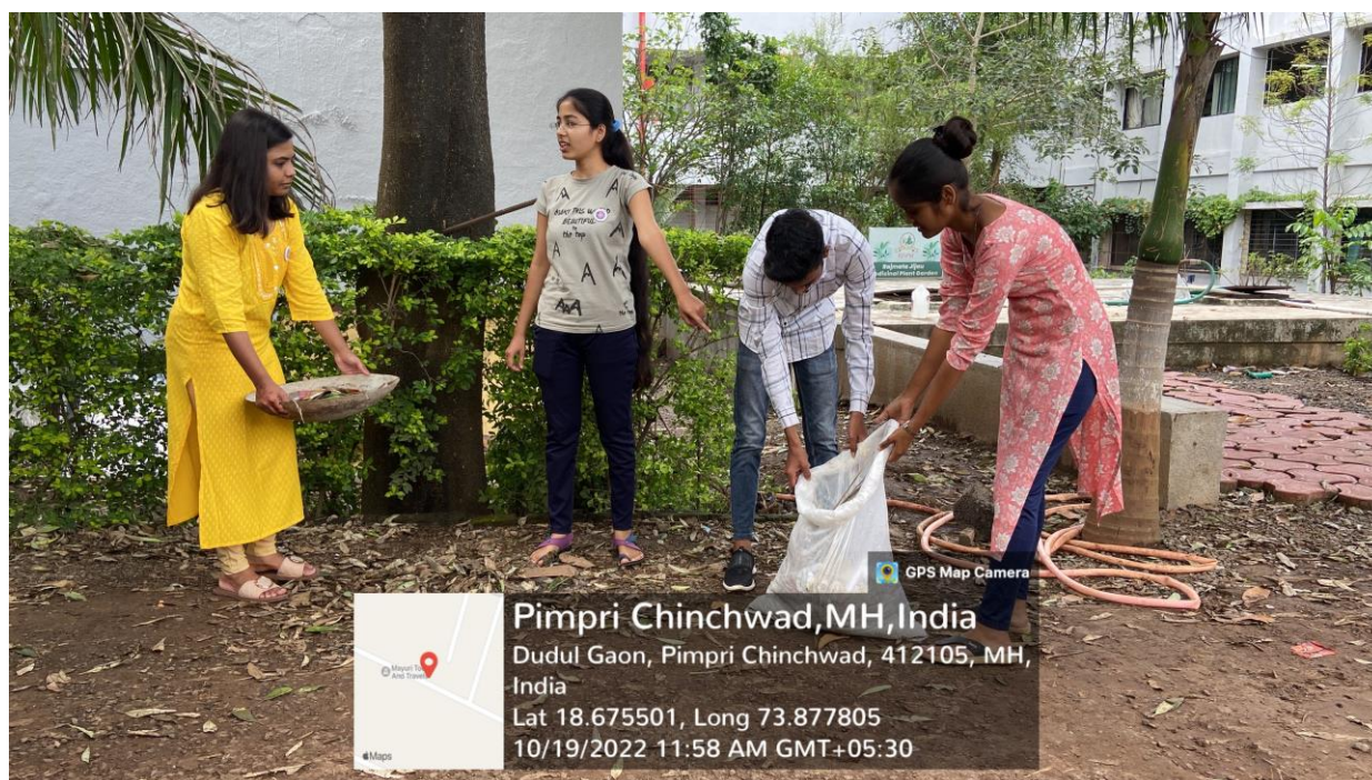
Collection of Plastic

All the students participated in the activity enthusiastically. All the students of B. Pharm worked very well and collected around 15 Kg of Plastic from the area. Also taken the Oath to keep the public places free from plastic and avoid the use of plastic, which will definitely avoid the disease spread which will strengthen the economy of the India.